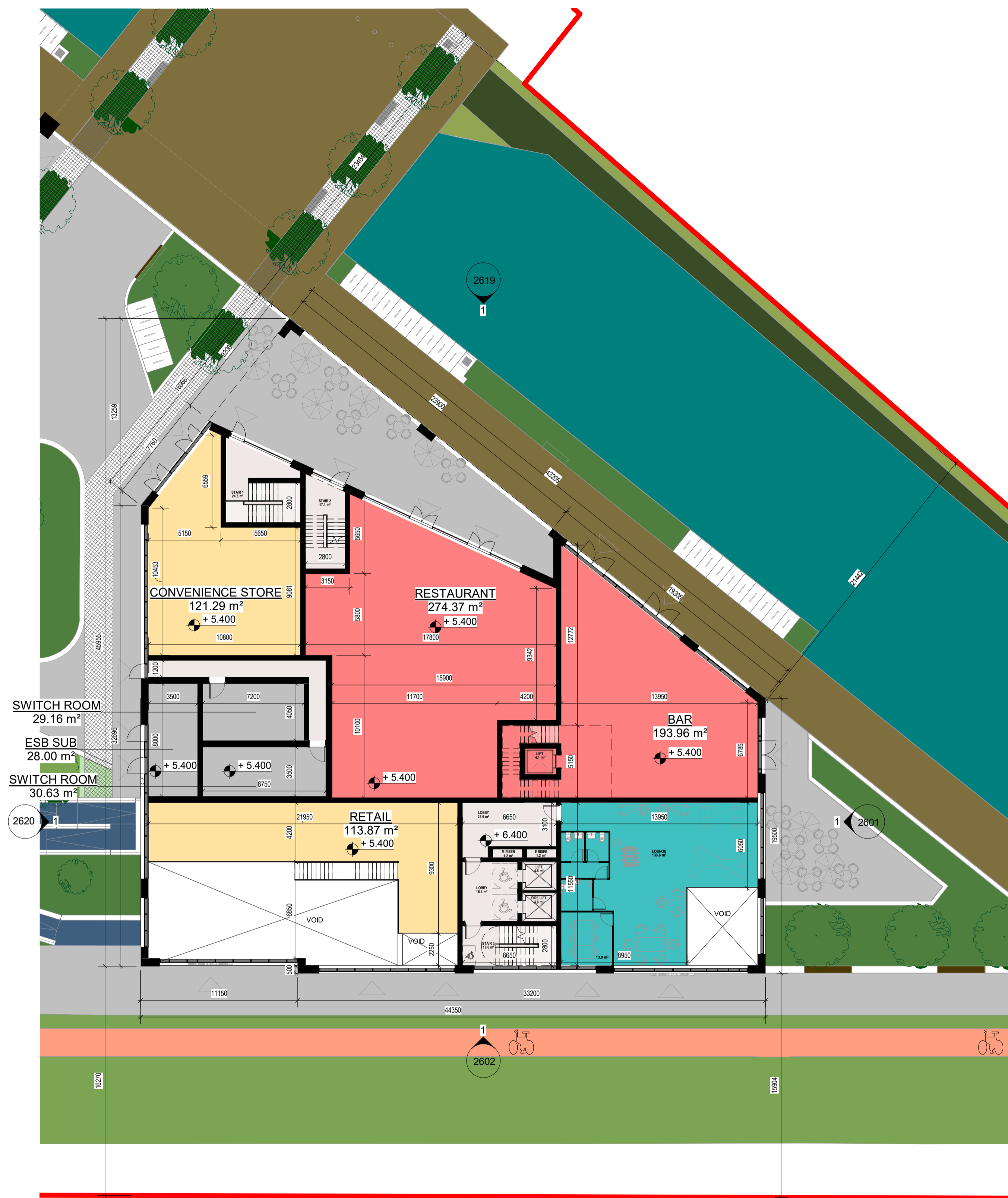
1 PLAN - BLOCK A - LEVEL 00 1 : 200

Please consider the environment before printing this sheet